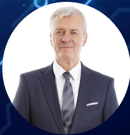
Santa Clara /CEO

He was a member of the Artificial Intelligence Laboratory at Stanford University and a fellow of the International Society of Artificial Intelligence. He was studying deep learning at the time. This advanced AI algorithm has a learning and operation process similar to the human brain's operating mechanism, and can be used to build a safer and more intelligent metaverse system. He was previously the CEO and founder of VANG, focusing on game intelligence.